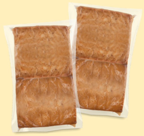
BULK VACUUM PACKAGING SEALED FOR ULTIMATE FRESHNESS

INGREDIENTS: ORGANIC TOFU (WATER, ORGANIC SOYBEANS, LESS THAN 2%: MAGNESIUM CHLORIDE, CALCIUM SULFATE), ORGANIC TAMARI SOY SAUCE (WATER, ORGANIC SOYBEANS, SEA SALT), ORGANIC APPLE CIDER VINEGAR, CONTAINS 2% OR LESS OF: WATER, ORGANIC PREPARED MUSTARD (ORGANIC DISTILLED VINEGAR, WATER, ORGANIC MUSTARD SEED, SALT, ORGANIC SPICES), ORGANIC APPLE JUICE, ORGANIC TOASTED SESAME OIL, ORGANIC ONION POWDER, ORGANIC GARLIC POWDER.